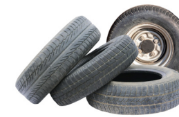
Tires with or without rims