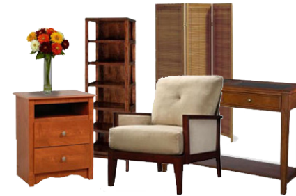
Refuse / Furniture