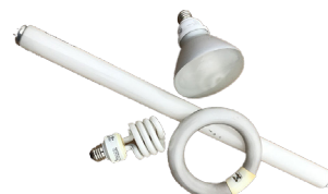
Mercury Containing Lamps or Devices