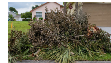
Residential yard trimmings