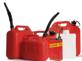
Gasoline, Kerosene & Diesel Fuel in an Approved Container