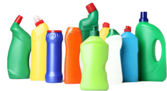
Household cleaners & Polishes**