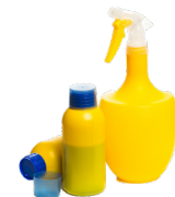
Pesticides & Herbicides