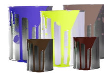
Paint, Strippers, Stains, & Varnishes**