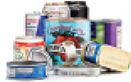
Aluminum, Tin & Steel Cans