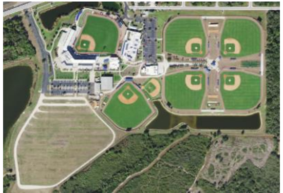
Charlotte Sports Park, 2300 El Jobean Rd, Port Charlotte